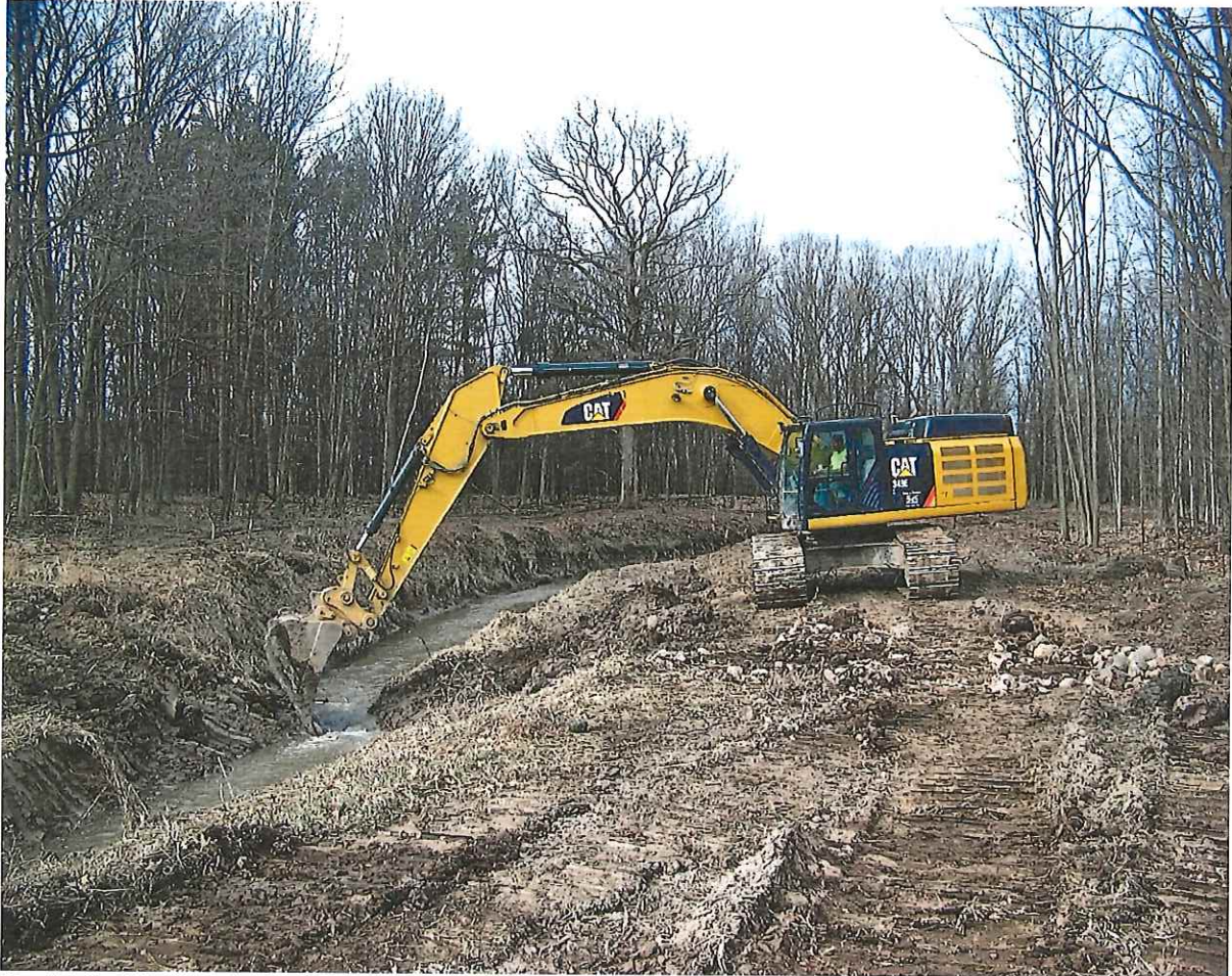
Hoppler Creek Drain Project